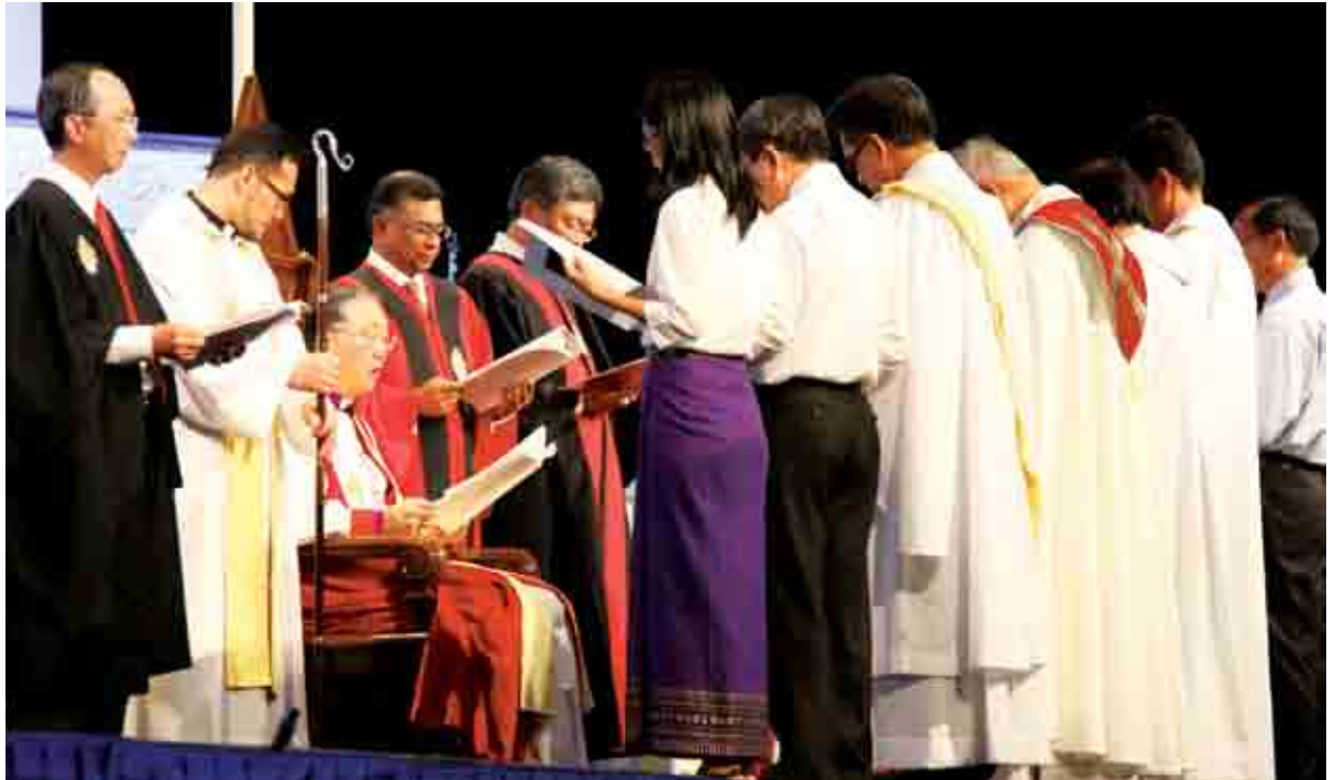
Centenary Evening Service (2009)