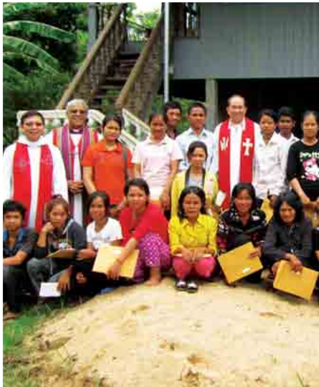
Our Mission Deaneries