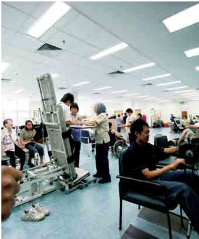
Our Community Services